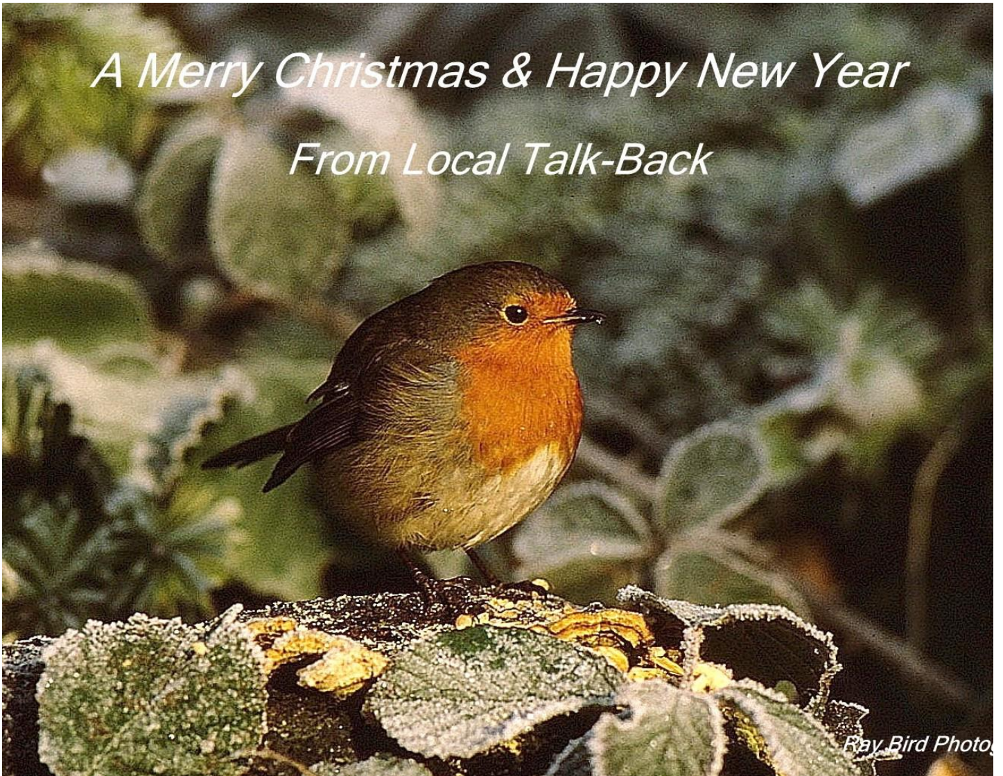
A Festive Robin.

A Merry Christmas & Happy New Year From Local Talk-Back