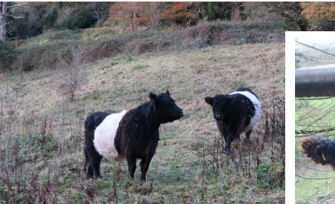
These inquisitive young cows with curly coats are Belted Galloways, a Highland breed. Adapted to live in poor upland pastures, these two are in the grounds of the National Trust's Newark Park.