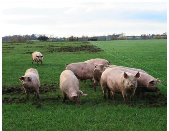
Pigs wallowing in the mud, somewhere near Bagpath